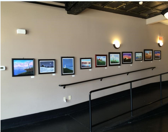
The ramp leading from the front door on Main Street to the theater contains much gorgeous artwork. The restrooms behind this wall take you back to a grander time with the fixtures and architecture.