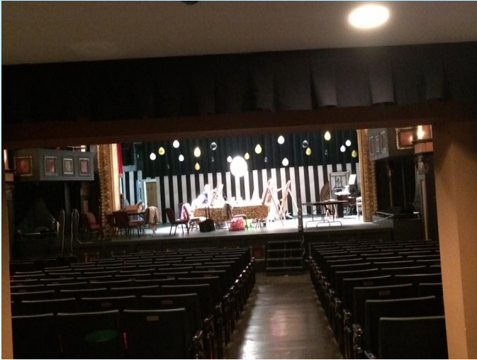
The Lancaster Grand Theater where a few people worked on art.